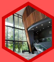
Royal Welsh College of Music & Drama