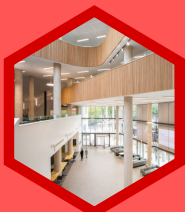
Centre for Student Life

Hosted @ The Royal Welsh College of Music & Drama